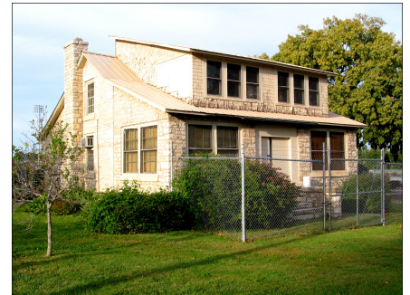
Marlatt Homestead, 1600 College Av.

The feasibility of turning the house and barn into a museum honoring land grant institutions is currently being evaluated.