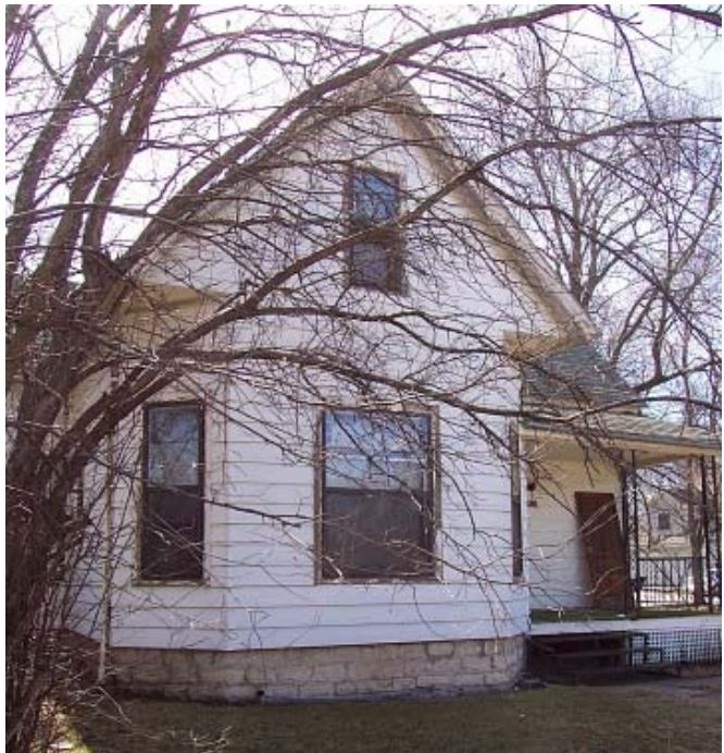
Behind the branches, another older home displays its original leaded glass windows. Far from vacant, this interesting house contains three apartments.