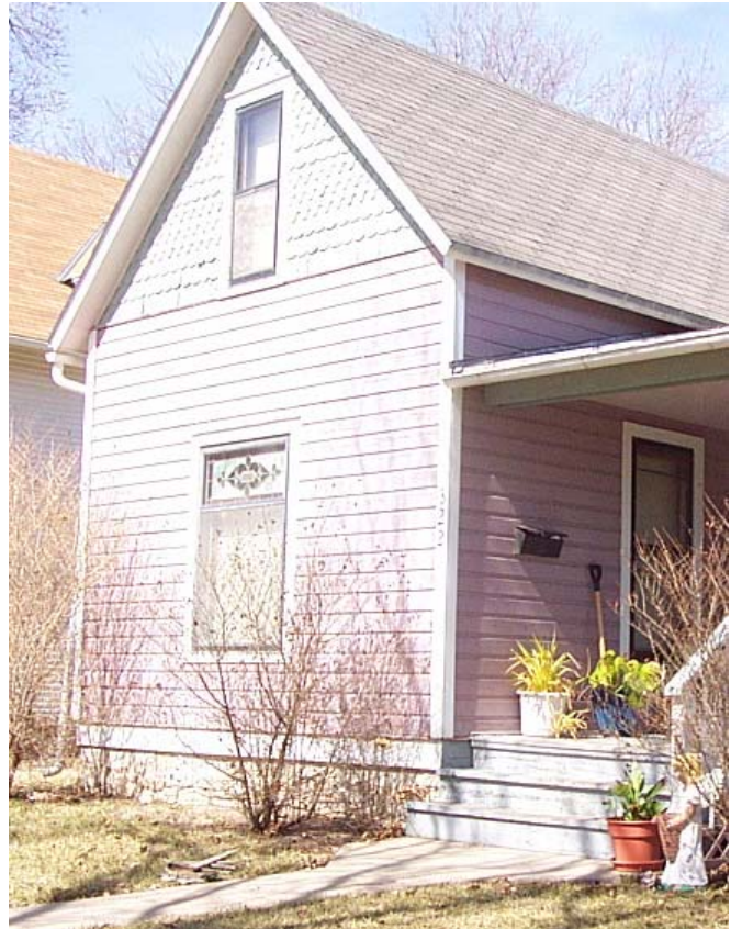
Check the architectural detail in this well-maintained older home in the proposed rehabilitation district.