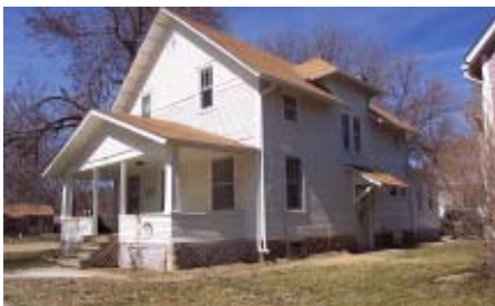
Small, serviceable—and occupied—homes on Osage between 3rd and 4th Streets. (Details next page)