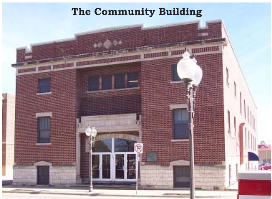
The Community Building