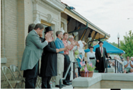
The VIPs and generous donors took their places....