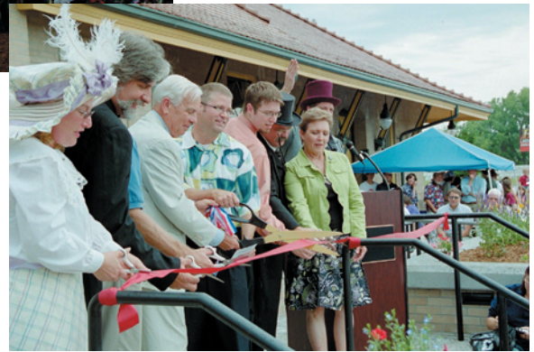
...The ribbon was cut and the crowd poured in to see the finished building.