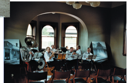
...and through it all the lively Bare-foot Dixieland Jazz Band played on!