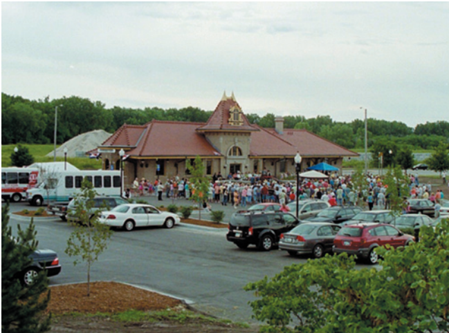
On June 3rd 2006 - or was it 1903? - the crowd gathered for the grand opening of our beloved depot.