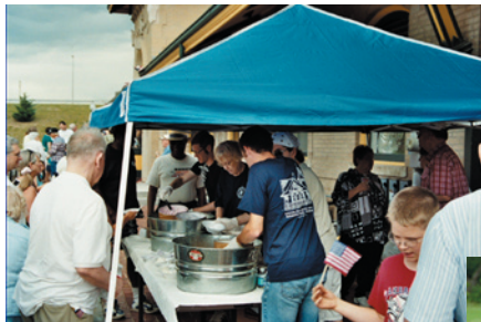
Volunteers kept the crowd cool with Ice cream and bottled water...