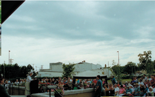
...The crowd listened and the anticipation mounted....