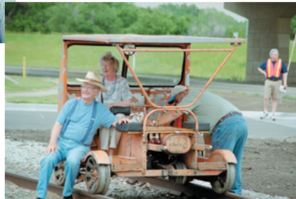
...everyone seemed to be having a wonderful time...