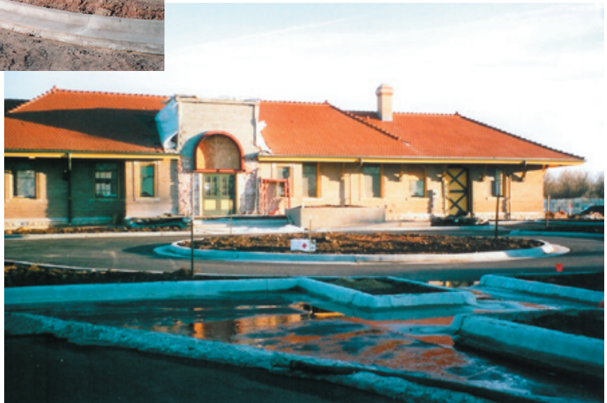
Asphalt Has Been Laid In The Parking Lot