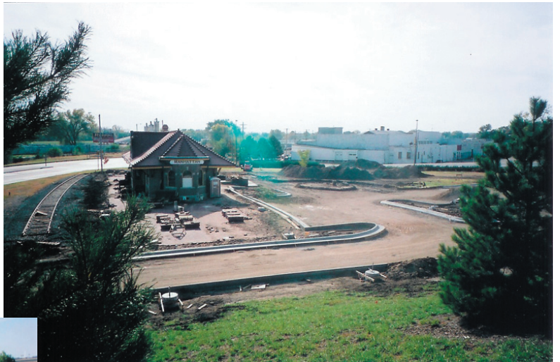
The Parking Lot Taking Shape