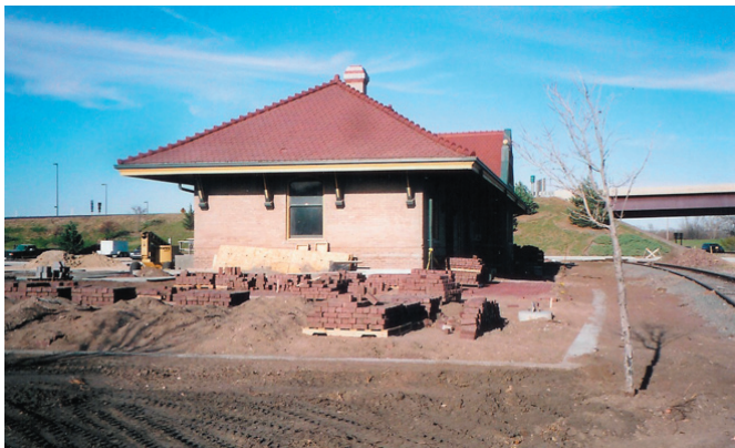
The Brick Platform Is Laid