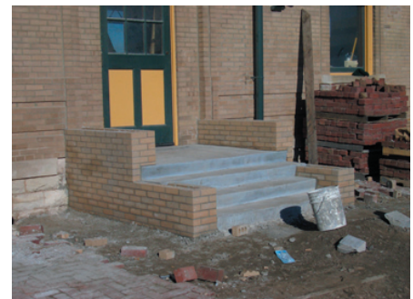
East Side Stairs