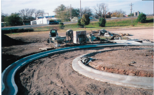
Concrete Curb And Guttering