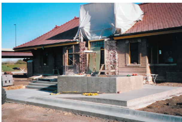
The Entry Stairs And Ramp Are Built