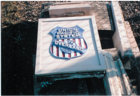
The Union Pacific Logo