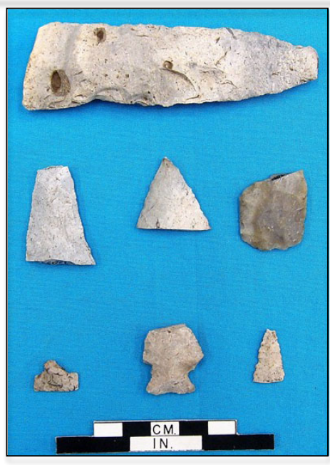
Sample of chipped stone tools from the Young Buck site (14RY402) representing different periods of use of the site.

Archaeological investigations such as those at Young Buck are needed at other potentially significant sites in this area. A number of other sites have been recorded over the years along Wildcat Creek and elsewhere in Riley County. Unfortunately, many of these have since been heavily damaged or destroyed largely through modern human activities including commercial and residential development. Those actions have accelerated and continue to threaten