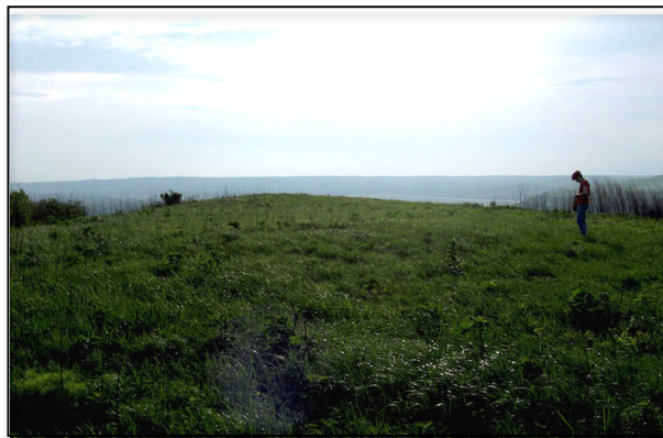
Above, probable burial mound (estimated age 1,000-2,000 years old) south of Manhattan, June 2011.

tools, a discarded pipe, and other objects also belie those places where people prepared food, made clothing, relaxed, and carried out a host of activities. Other remnants of past events consist of charcoal, ash, or reddened soil indicating a fireplace; soft, hard-packed, or discolored sediments showing where people built their homes or stored their food; or piled or aligned stones and earth that served as trail markers or burials. These clues suggest the location of native villages, prehistoric camps, cemeteries, quarries, hunting and butchering sites, and other places where ancient people carried out daily and special activities.