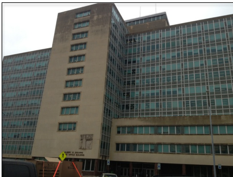
Robert B. Docking State Office Building

The Capitol Building and Docking are connected by a tunnel, which provides convenient access for legislators and state employees. The mechanical systems for both Docking and the Capitol Building are located in the lower levels of Docking and are connected to the Capitol via the tunnel. If Docking were demolished, the plan to provide mechanical systems for the Capitol would be to (continued on pg. 5)