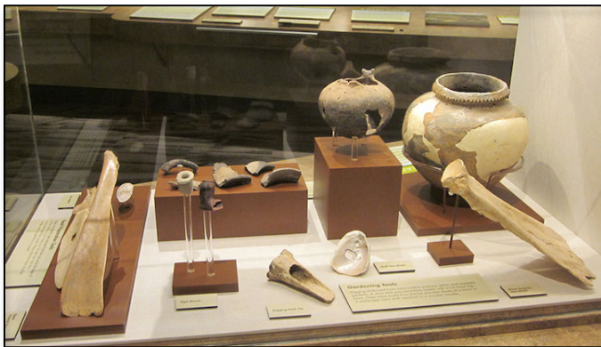
Sample of Central Plains tradition artifacts (ca. A.D. 1000-1400) that inform the Winds of the Past gallery of the Flint Hills Discovery Center.