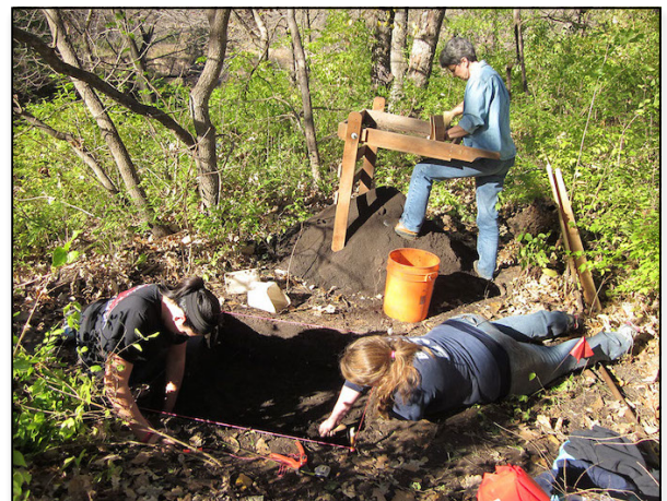
Test excavations at a prehistoric archaeological site (estimated age 600-1,000 years old), Manhattan, Nov. 2013.

Just as we archive historic documents that provide insights to our history and the visible structures or features that remain, we must also properly curate archaeological data, the primary "documents" or direct evidence of the distant past, for future generations. This is especially important given the continual advancement in techniques that enhance interpretation of past (continued on pg. 4)