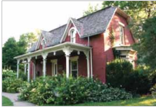
Robert Uhrlich House