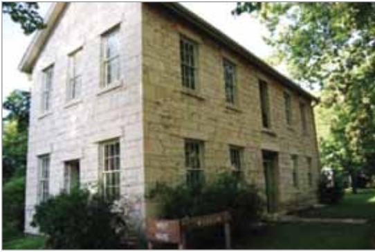
Wolf House Museum