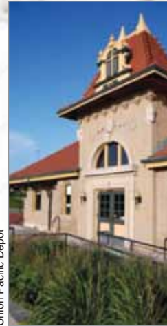
Union Pacific Depot

Promoting Historic Preservation Since 1994