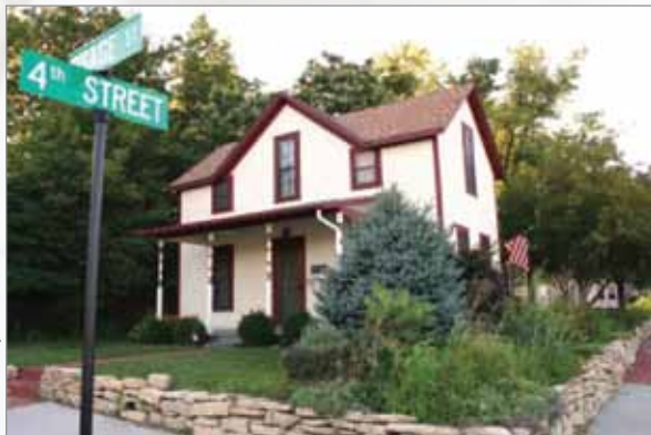
Damon Runyon House

For more information, visit www.PreserveManhattan.org , or find us on Facebook: Manhattan/Riley County Preservation Alliance.