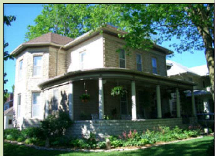
Private Maintenance & Preservation Middle left, 600 Houston Street Middle right, 801 Houston Street Bottom left, 216 South 17<sup>th</sup> Street