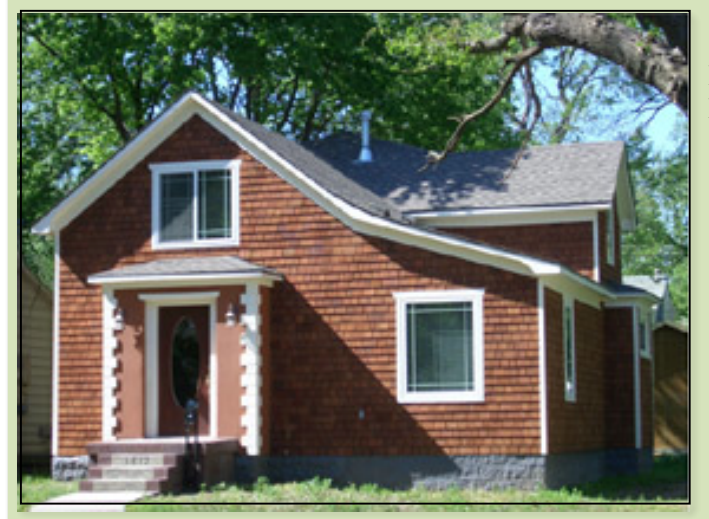
Commercial Whole Building Restoration Left, 1612 Osage Street Right, 311 Poyntz Avenue