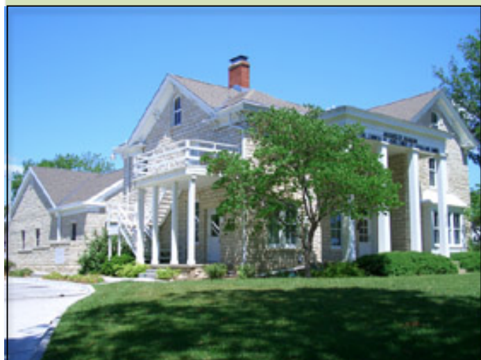
Commercial Addition Top left, 1820 Claflin Road Below right, 1015 North Sunset Avenue