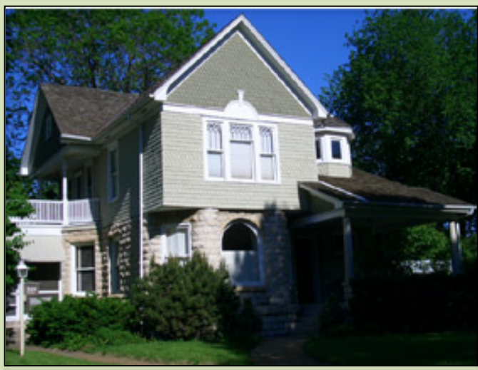
Private Whole House Restoration Middle right, 325 North 14<sup>th</sup> Street Bottom left, 314 Denison Avenue Bottom right, 1507 Leavenworth Street